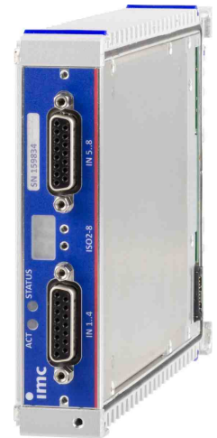
CRXT/DI2-16 (Fig. similar)