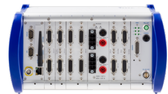
imc CRONOScompact portable housing