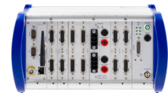
imc CRONOScompact portable housing